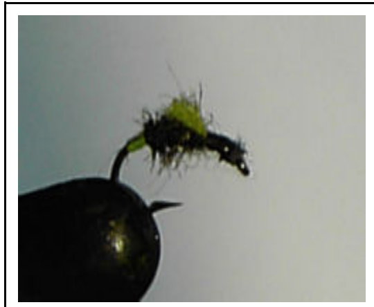
PEACOCK AND ANTRON EMERGER